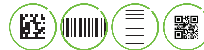
4. Auto Diversion

The feeders can be linked for cascade feeding. If one feeder runs empty, another one takes over, given a total capacity of 2000 sheets. The standard feeders contain empty sensors for auto-start after refilling the feeders.