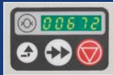
Re-settable electronic counter.