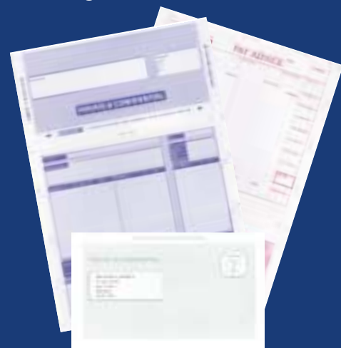
Pressure seal forms catering for a wide range of mail applications.

The AS300 and AS500 are only part of PFE's comprehensive range of pressure sealers - Please contact us for more information.