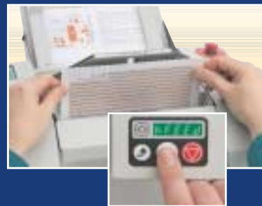
Single form hand-feed station.